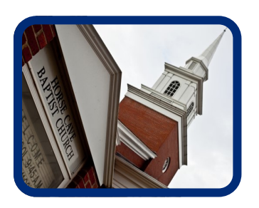
301 East Main Street Horse Cave, KY 42749